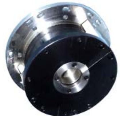
A Custom Zero Backlash Positioning Brake used in Medical Imaging

Carlyle Johnson has almost 100 years' experience in producing high quality clutches and brakes. Our clutch knowledge and capability to respond to customer requirements is known throughout the industry. We offer a full-time engineering staff to assist you with new applications and in solving power transmission problems. We provide clutches, brakes, and power take-off packages for defense, commercial and military aircraft, space applications, medical equipment, packaging machinery, oil exploration, power generation, printing machinery, and machine tools. This knowledge and ability in producing special solutions for difficult applications is available to you. Simply contact us and ask for help.